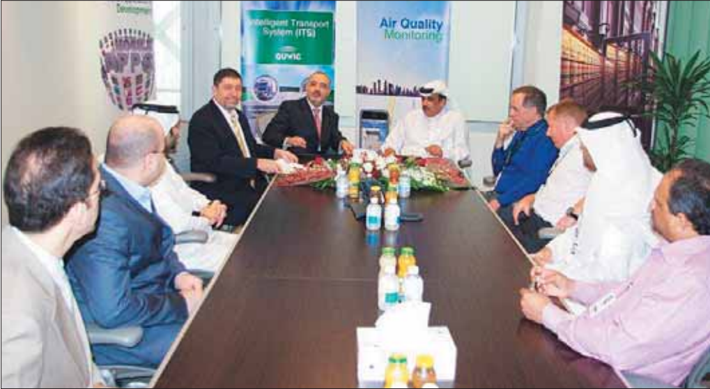
Officials of QUWIC and QF at a meeting, in Doha, recently.