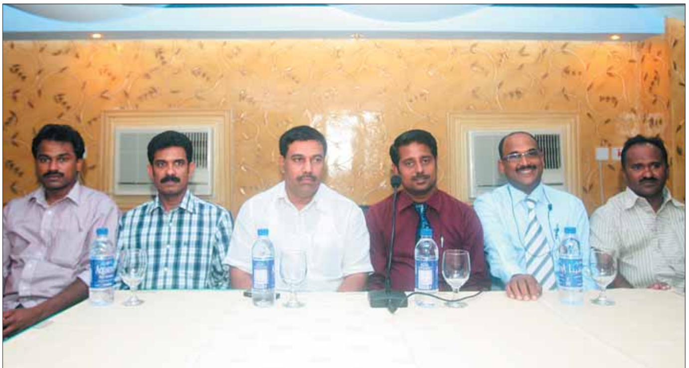
Officials of Royal Palace restaurant at a press conference, in Al Wakrah, on Wednesday.