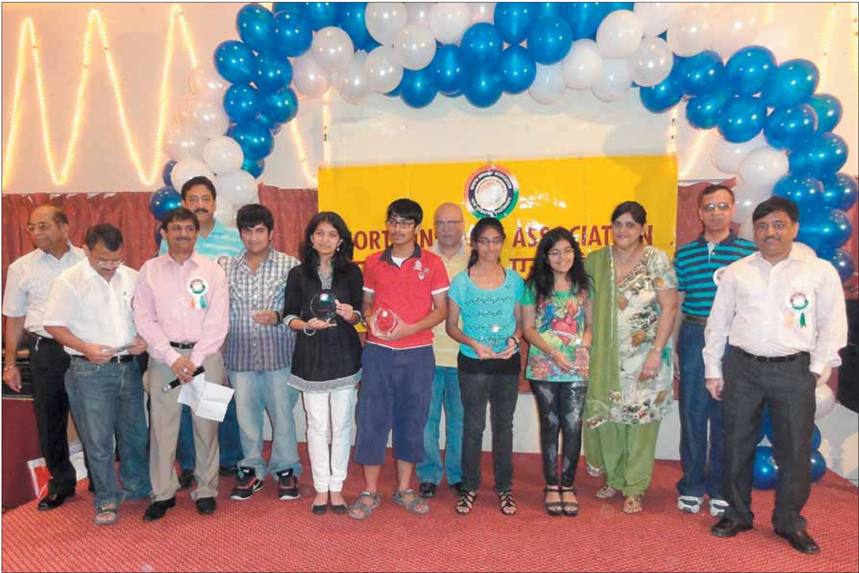
NIA members with the HSC and SSC students at a function, in Doha, recently.