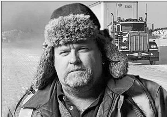
7:00 pm The History Channel: ICE ROAD TRUCKERS