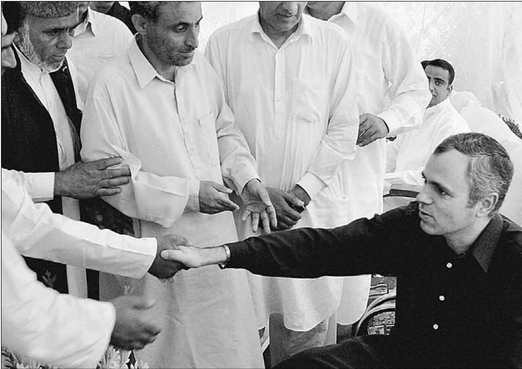
Jammu and Kashmir Chief Minister Omar Abdullah (right) meets people, in Srinagar, recently.

“The speaker shall decide whether the same should be