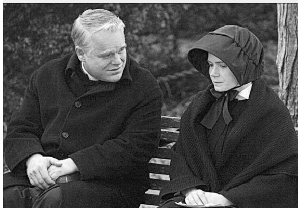
8:00 pm Star Movies HD: DOUBT