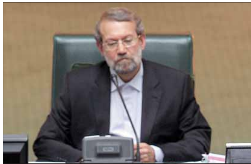
Iranian Parliament speaker Ali Larijani, in Tehran, recently.

The visit to North Korea would have been the first visit by an