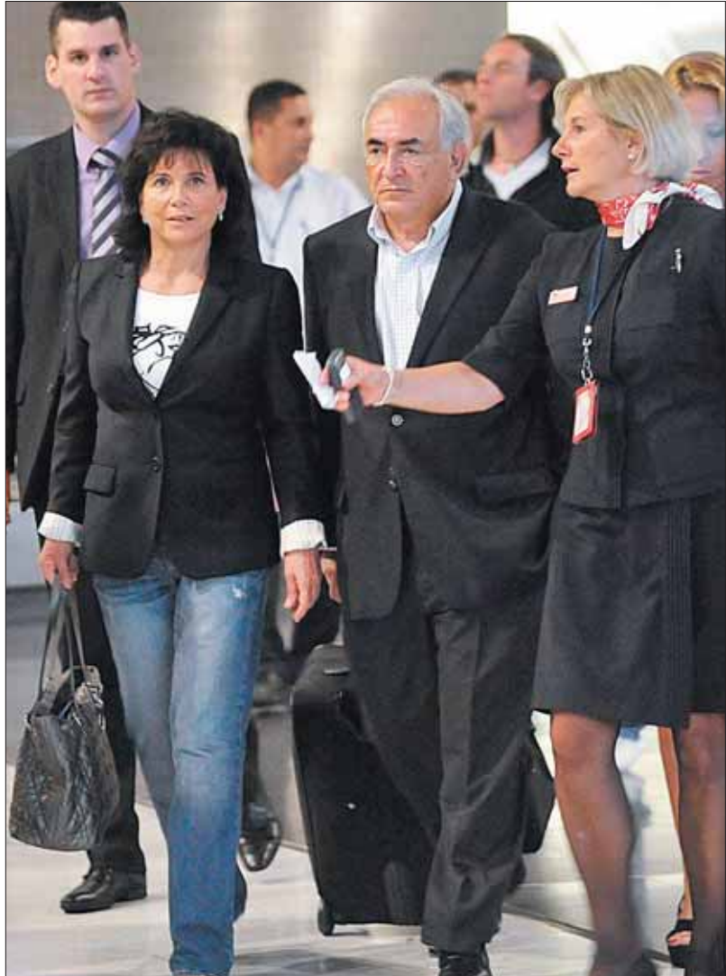
Former IMF chief Dominique Strauss-Kahn (centre) and his wife Anne Sinclair (left) arrive at Charles de Gaulle Airport, in Roissy, near Paris, on Sunday.

"I'm eager to return to my country," Strauss-Kahn had told reporters outside his home in Lower Manhattan on August 23 after the charges against him were dropped, calling the legal saga a "terrible and unjust ordeal".