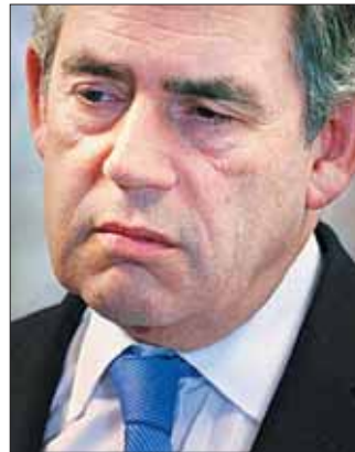
Former British prime minister Gordon Brown

The Bank of England led by Mervyn King was also slow to grasp the nature of the finan-