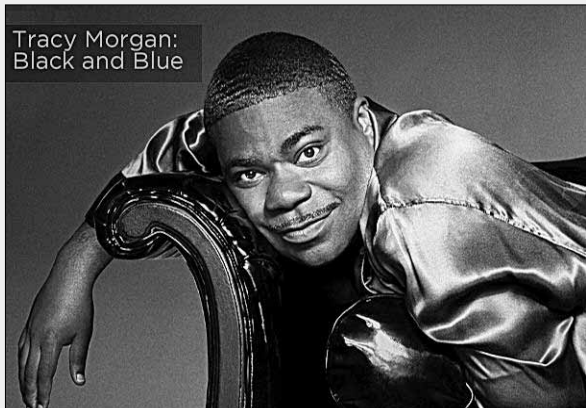
10:00 pm OSN Comedy: TRACY MORGAN: BLACK AND BLUE