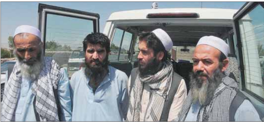
Turkish engineers after they were released by their Taliban captors, in Ghazni province, on Saturday.