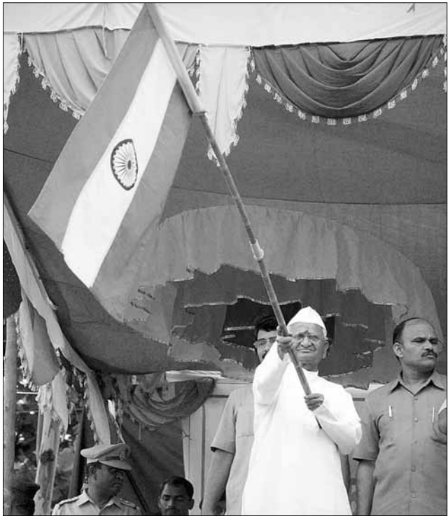
Anna Hazare (left) waves a tricolour during a meeting, in Ralegan Siddhi village, in Maharashtra, recently.

CAUTIONING the government against sending a ‘wrong message’ after privilege and income tax notices were slapped on members of his team, Anna Hazare said undue harassment of civil society members may cause unrest in the country.