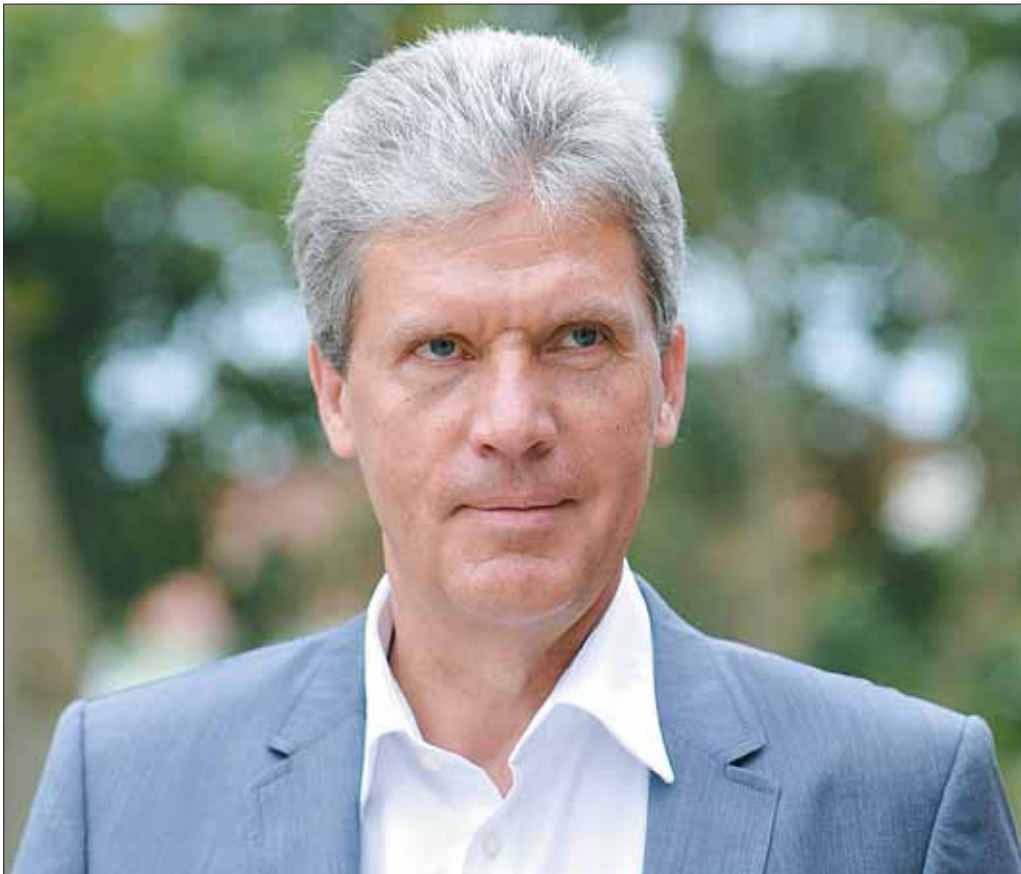
The top candidate Helmut Holter of left-wing Die Linke party, in Schwerin, on Sunday.

The far-left Linke party is seen winning around 17 percent of the vote, with the