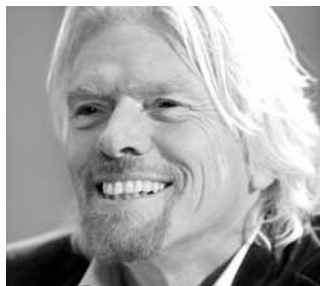
RICHARD BRANSON | NYT NEWS SERVICE

It's also known that the areas of the brain that regulate sleep patterns have "a lot of cross talk with areas of the brain that release hormones and other mediators that influence blood pressure," Redline said. When those areas of the brain are not entering slow-wave sleep, she added, it may interfere with various brain signals that influence blood pressure.