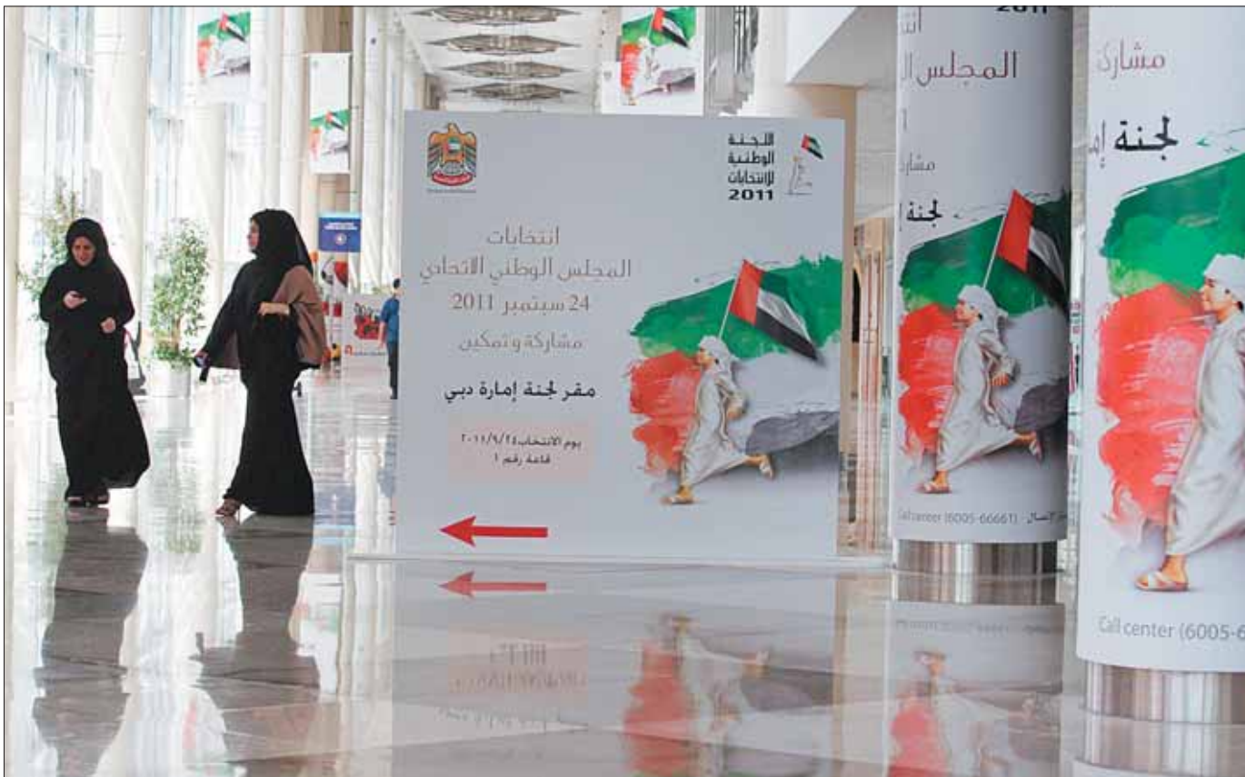
Emirati women walk past election banners at a registration centre, in Dubai, on Sunday.