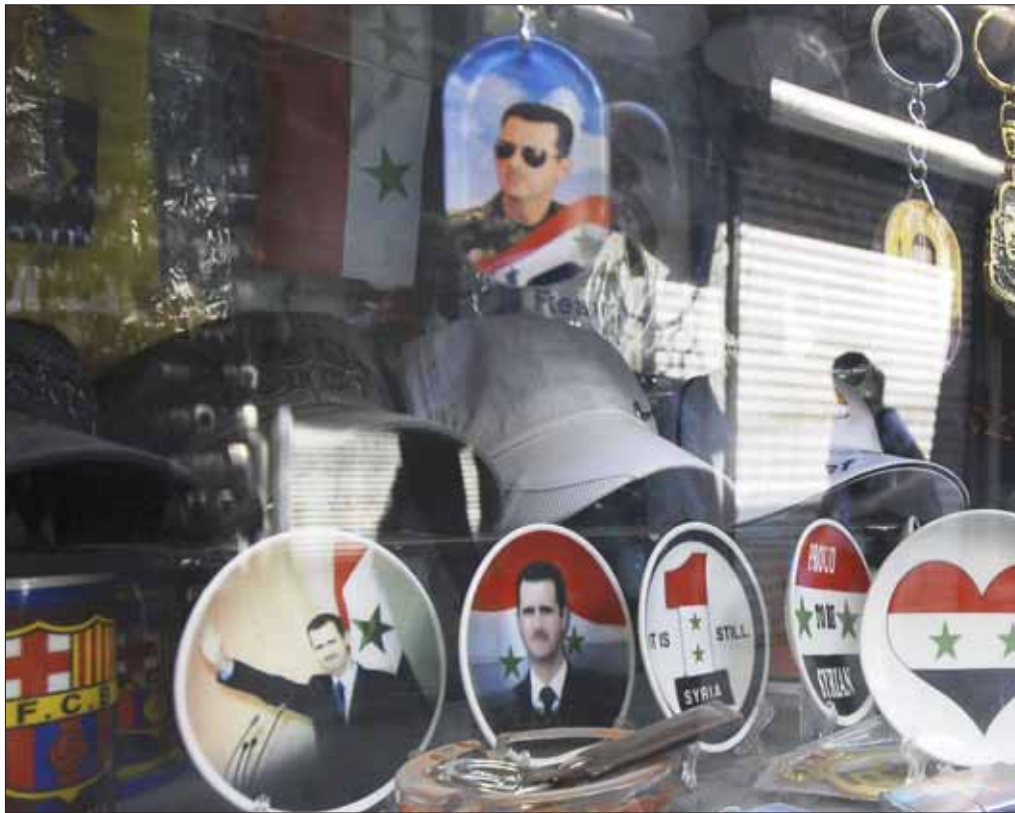
Souvenir plates with portraits of Syrian President Bashar al Assad displayed at a shop, in Damascus, on Saturday.

He also reported eight others people killed in the northwestern Idlib province, including two people in the