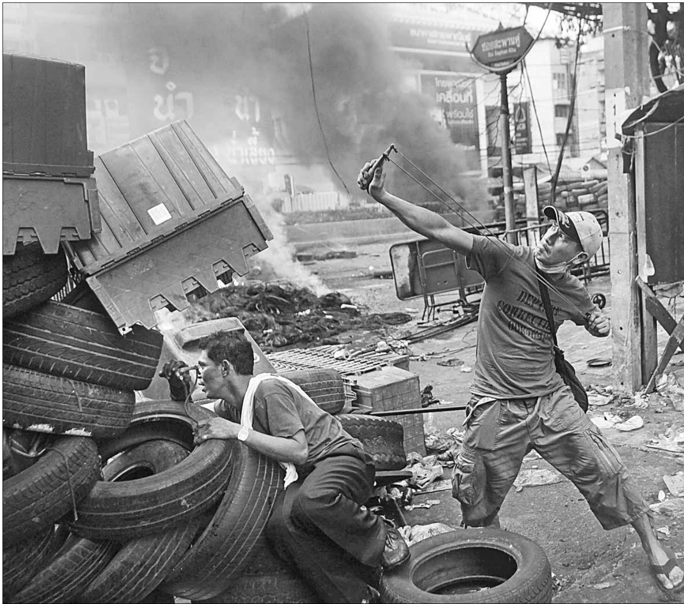
One of anti-government protesters fires a slingshot towards Thai soldiers during a demonstration, in Bangkok, Thailand, recently.

Fifty-four people have been charged with terrorism and could face from three years to life in prison, according to figures obtained by The Associated Press through Thailand's Official